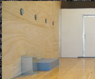
Plywood lining with D-rings