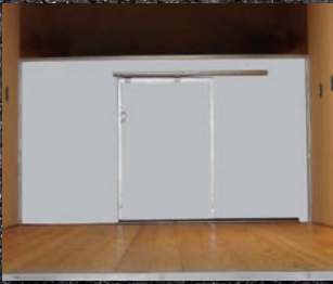
Sliding cab-access door