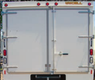
Full-width rear swing-out doors